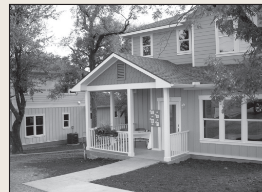
A beautiful new Glen Oaks Corner house.